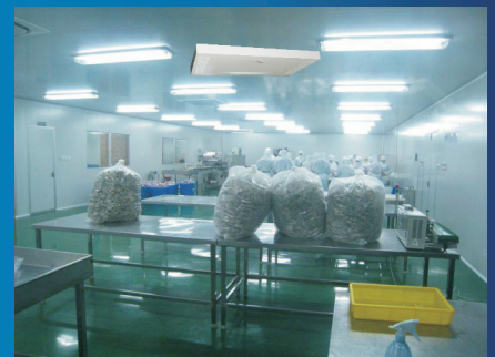
Food processing plant