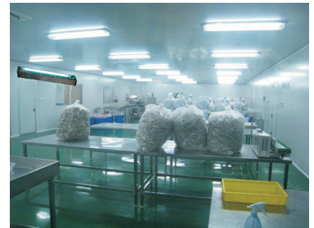
Food processing plants