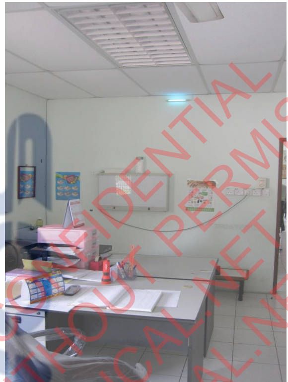
TB Consultation Room