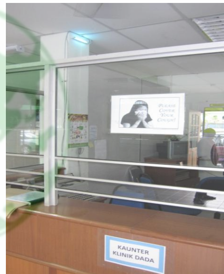
Patient's Registration Counter