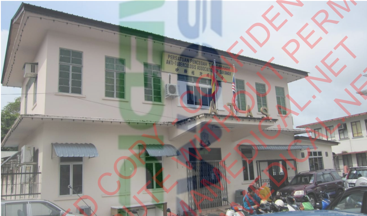
In front of the Building of Anti-Tuberculosis Association of Sarawak