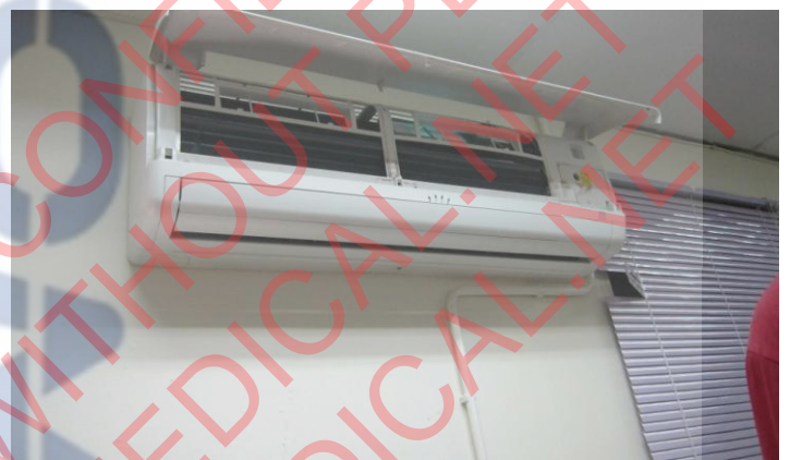
TB Laboratory Room