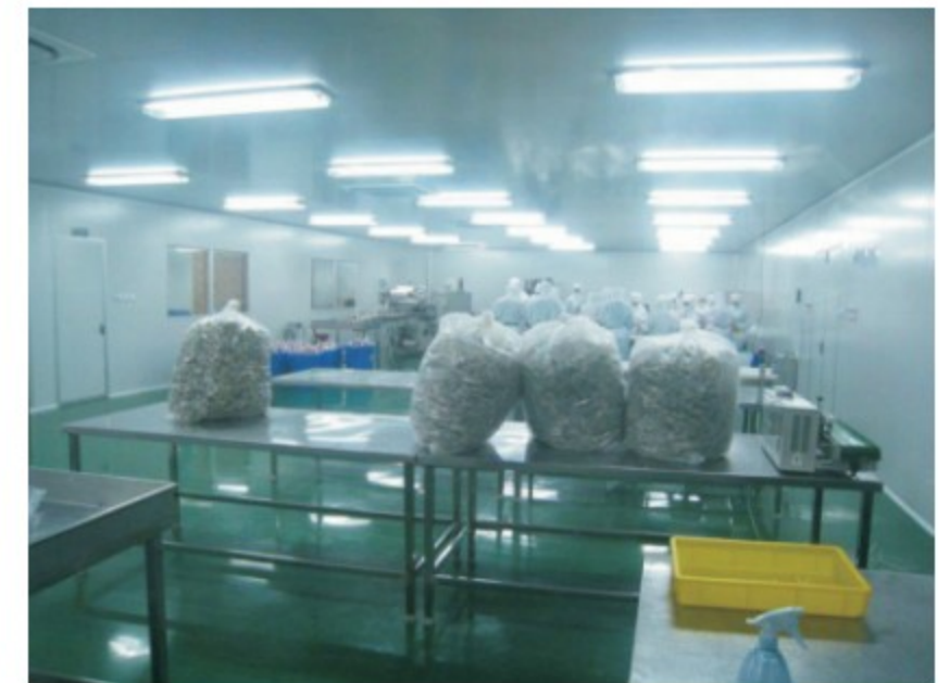
Food processing plant