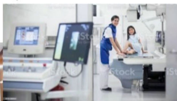
X Ray room