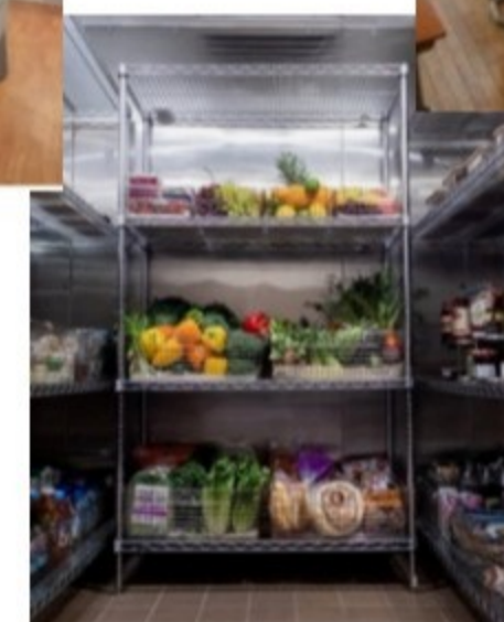
Food processing plant