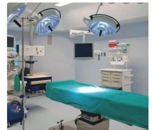
Minor OT theatre