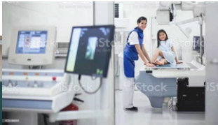
X Ray room