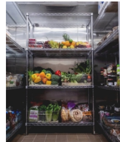
Food Storage Areas Kitchen